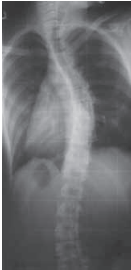
Scoliosis, and other major distortions in posture, benefited little from rehabilitation until just over a decade ago.

The efficacy of the brace in cases of AIS is best between Risser 0-2 – or roughly pre-menarche, or change in the voice, in the case of male patients – where most of the growth occurs in the trunk. In this age group, the DB has been proven not only to correct, or stabilize, the scoliotic curves